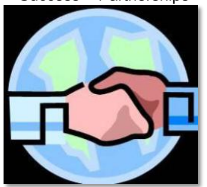
Federal, State, Local, Academia, Others.....