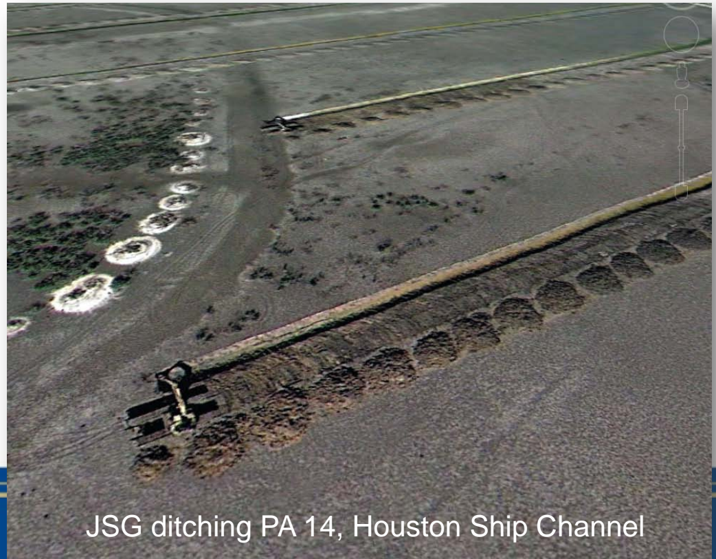
JSG ditching PA 14, Houston Ship Channel