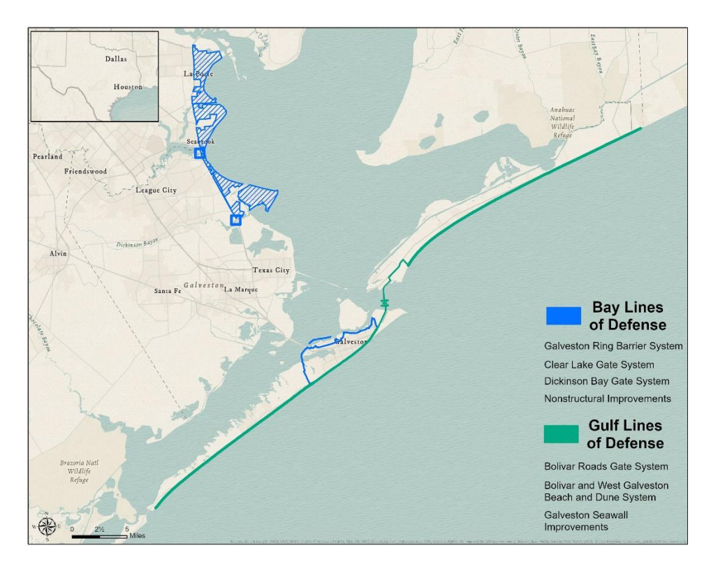
Figure 3. Galveston Bay Storm Surge Barrier System