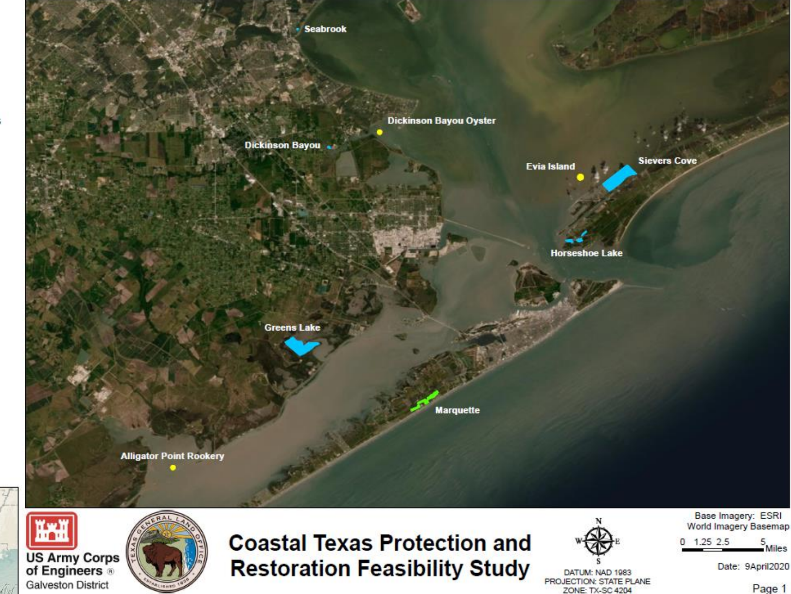
Figure 5. Potential Mitigation Sites