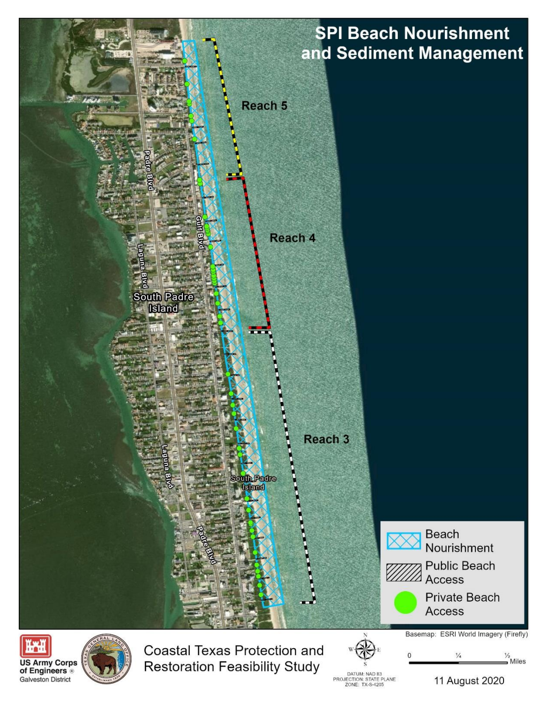
Figure 2. South Padre Island CSRM

Lower Texas Coast Plan: The lower Texas coast component of the recommended plan includes 2.9 miles of beach nourishment at South Padre Island to be completed on a 10-year cycle for the authorized project life of 50 years (Figure 2).