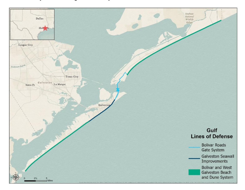
Figure 4. Gulf Lines of Defense of the Galveston Bay Storm Surge Barrier System