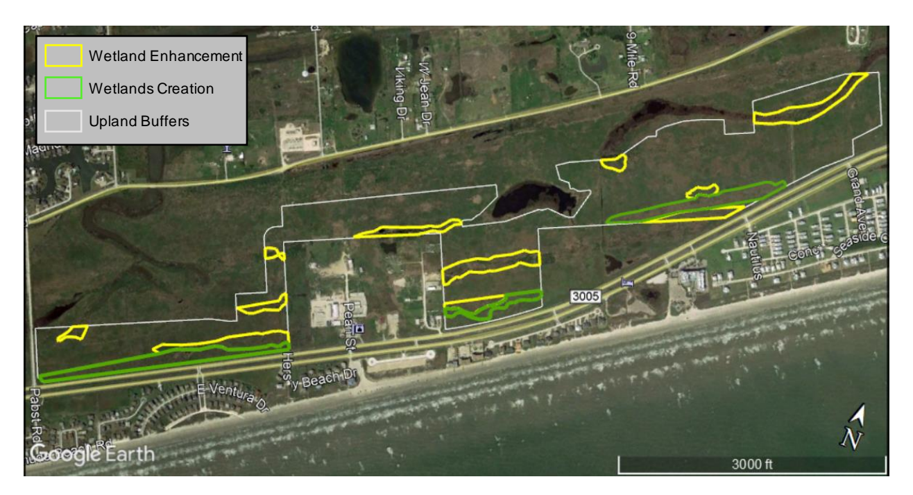
Figure 6. Marquette Mitigation Site