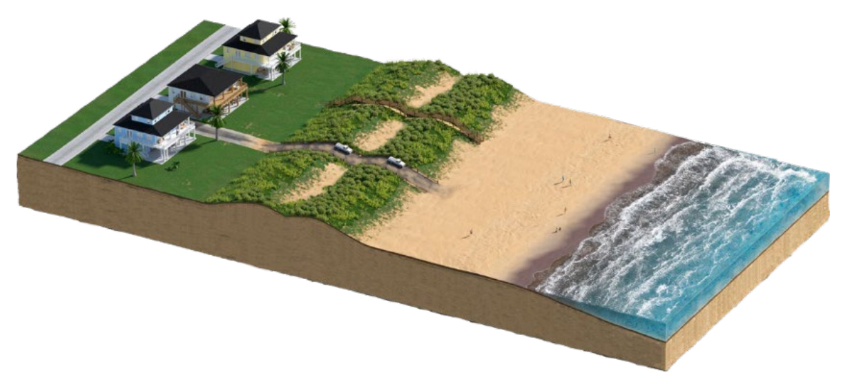
Figure 1: Conceptual rendering of a proposed dual dune beach and dune system with walkovers and driveovers.

There will be no changes to the number of or location of public access points with the proposed CSRM beach and dune nourishment and sediment management plan on South Padre Island. Walkovers will be constructed and/or rebuilt, as necessary, to maintain accessibility post-construction (Figure 1).