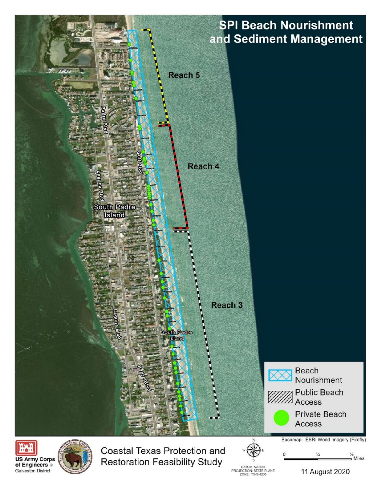
Figure 4. South Padre Island Beach Nourishment and Sediment Management