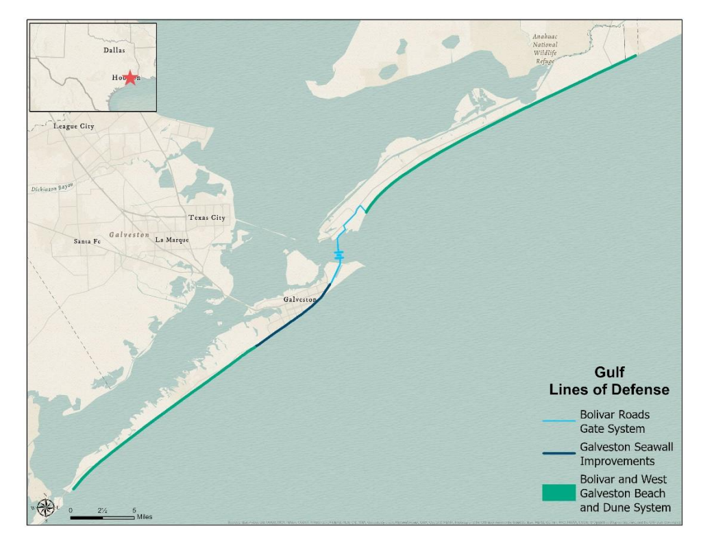
Figure 4. Gulf Lines of Defense of the Galveston Bay Storm Surge Barrier System