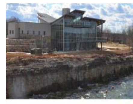
Dewey Short Visitor Center, Table Rock Lake