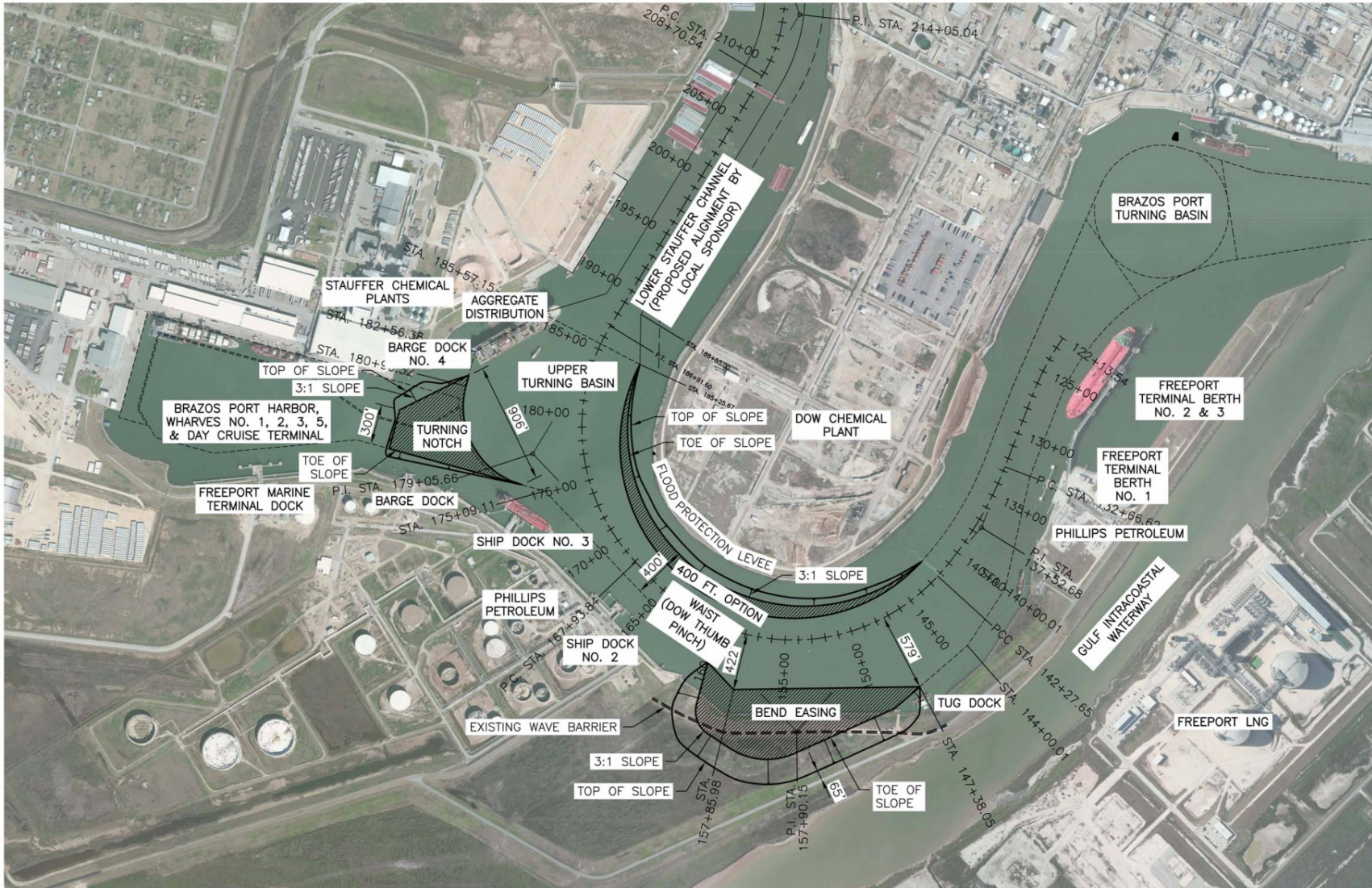
Figure 2: Construction Project Area