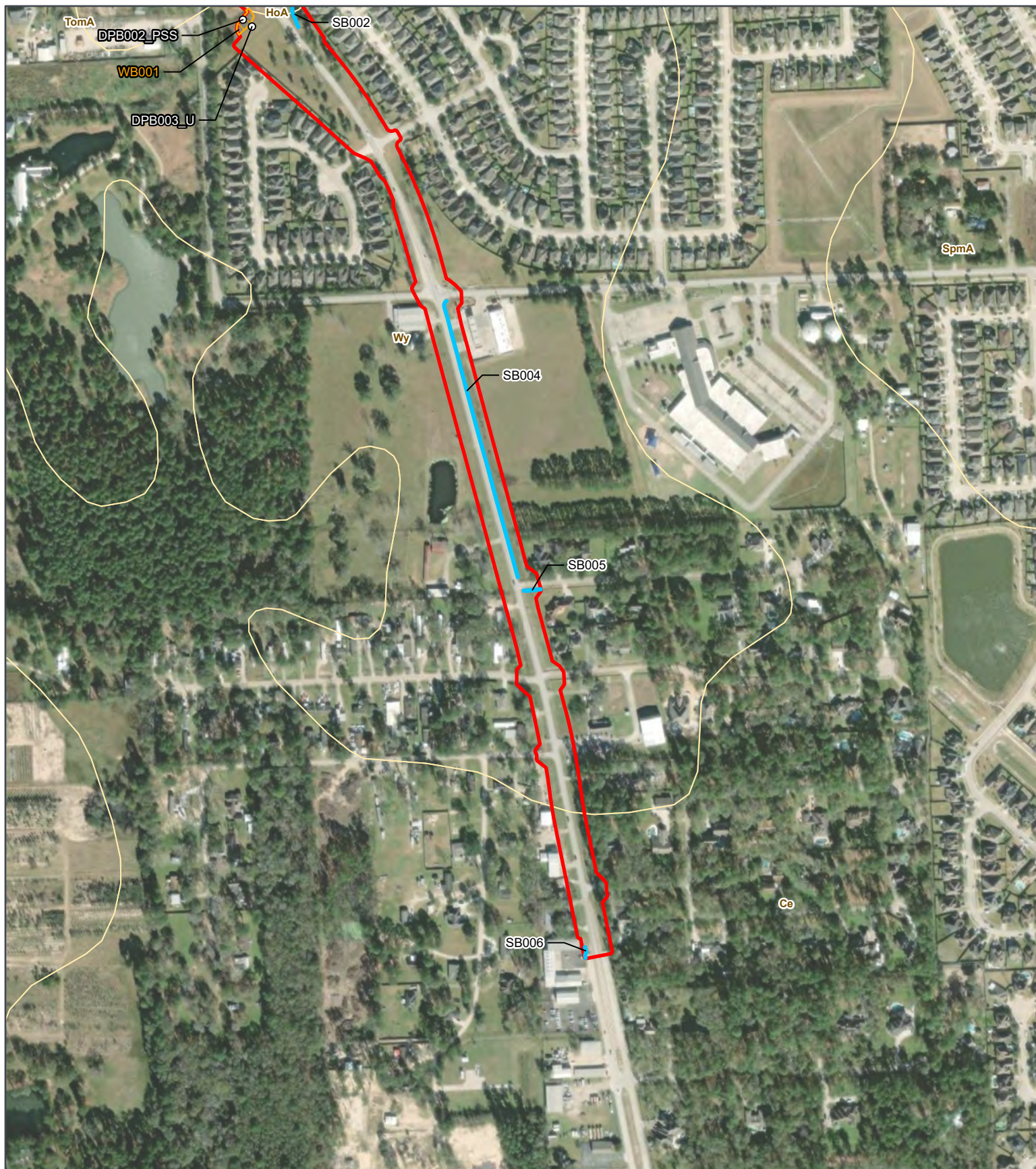
Figure 2 Page 2 of 2