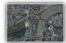
Imagery with Labels