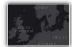
Dark Gray Canvas