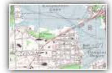
USGS Topo Map