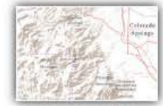
Terrain with Labels