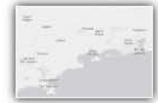
Light Gray Canvas